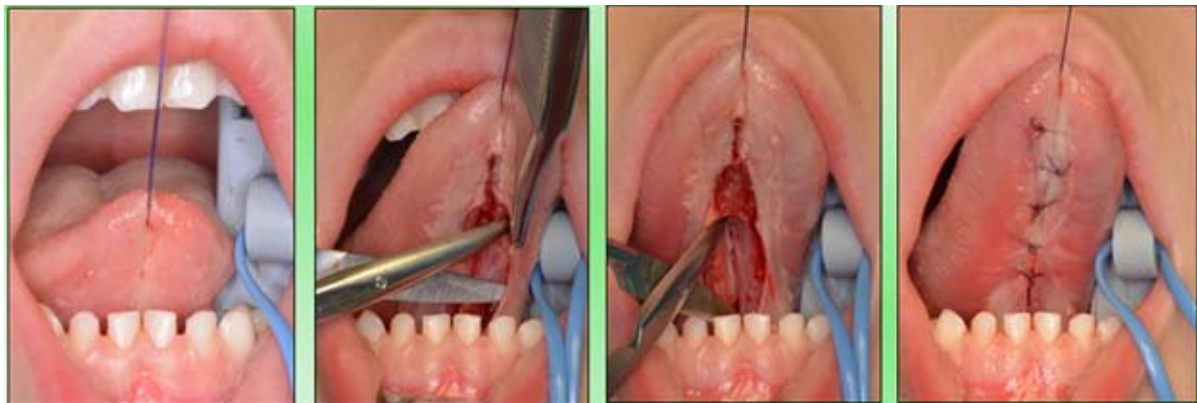
Fig. 2. Surgical Technique. Frenectomy, rhomboid plasty and myotomy.

On many occasions, the rehabilitation of the tongue and the dyslalia as a result of ankyloglossia are resolved parallelly. This fact is explained through the free movement of the tongue and the work of the lingual muscles.